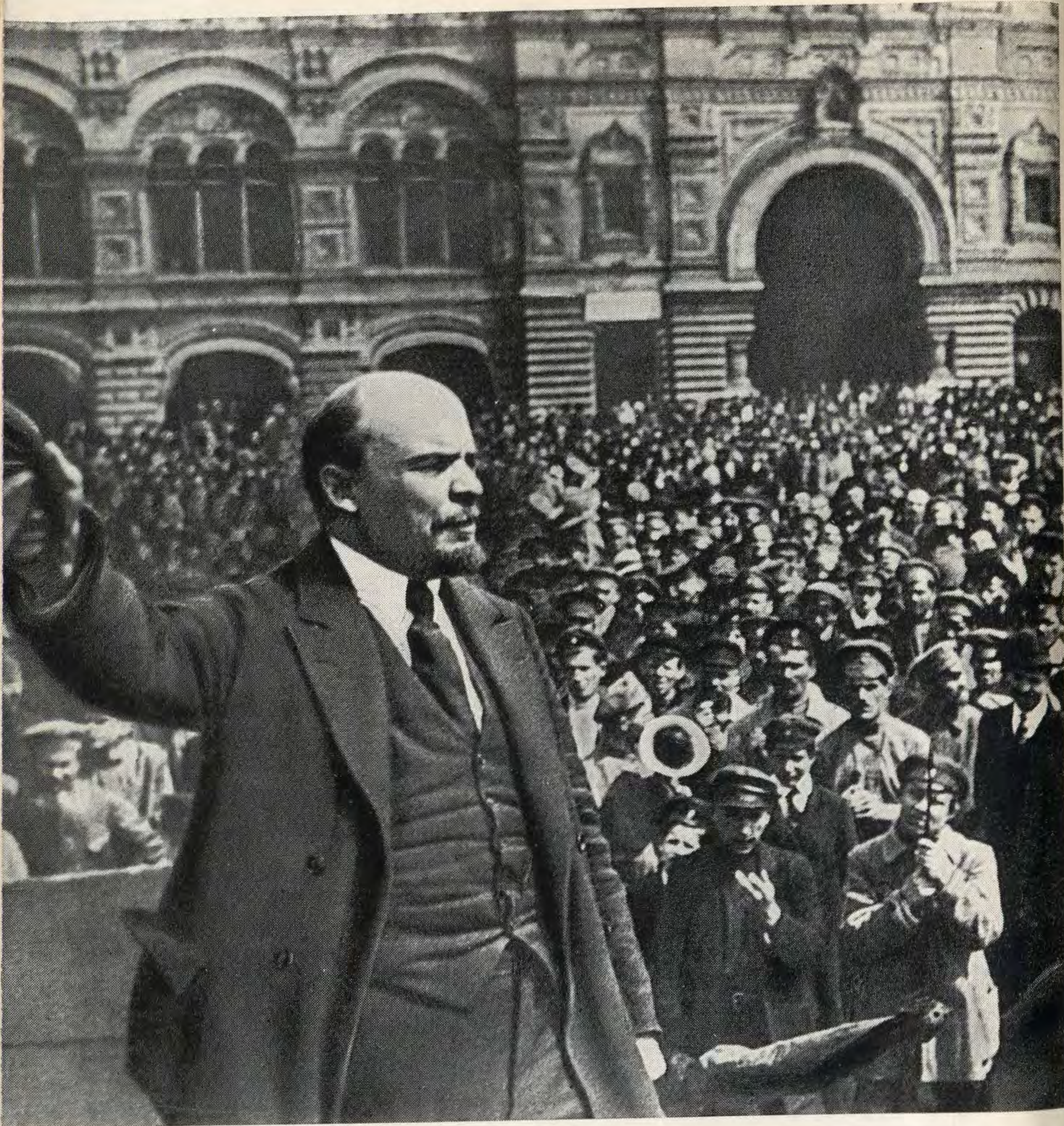
Lenin addresses the Vseobuch troops on the Red Square, May 25, 1919