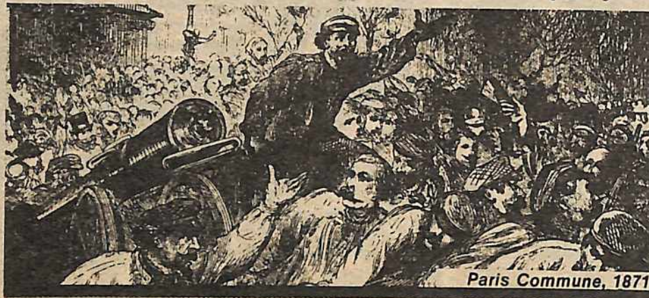
Paris Commune, 1871