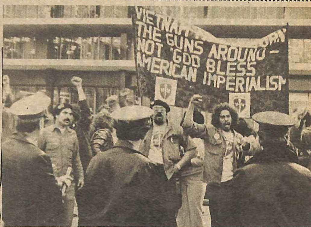
Vets square off with L.A. pigs after two long minutes in the center stage spotlight at 1979 Academy Awards. This "sacred cow" of the bourgeoisie was turned into a political arena to expose "The Deer Hunter"; a 'non-political' movie about Viet Nam.

This claim of innocence is a white-wash. Everything people learned from the Vietnam War is turned on its head. Every attempt is made to direct the audience's anger against the "enemy."