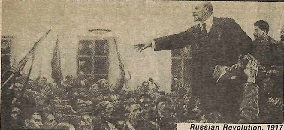
Russian Revolution, 1917