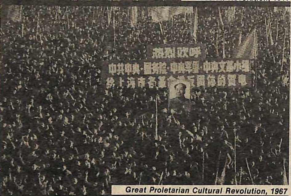
Great Proletarian Cultural Revolution, 1967