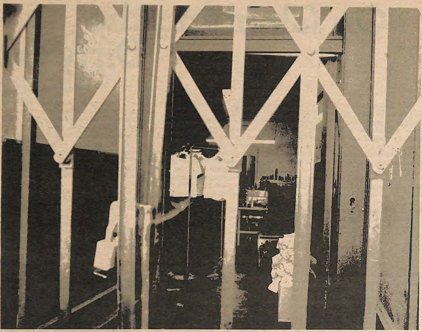
Gate of a garment shop in the "La Costura" district of L.A.

We asked some of the proletarians if life in the belly of the beast was what they had expected. One woman told us, "I thought it would be better. You always think it will be better. But even though me and my husband both work, we