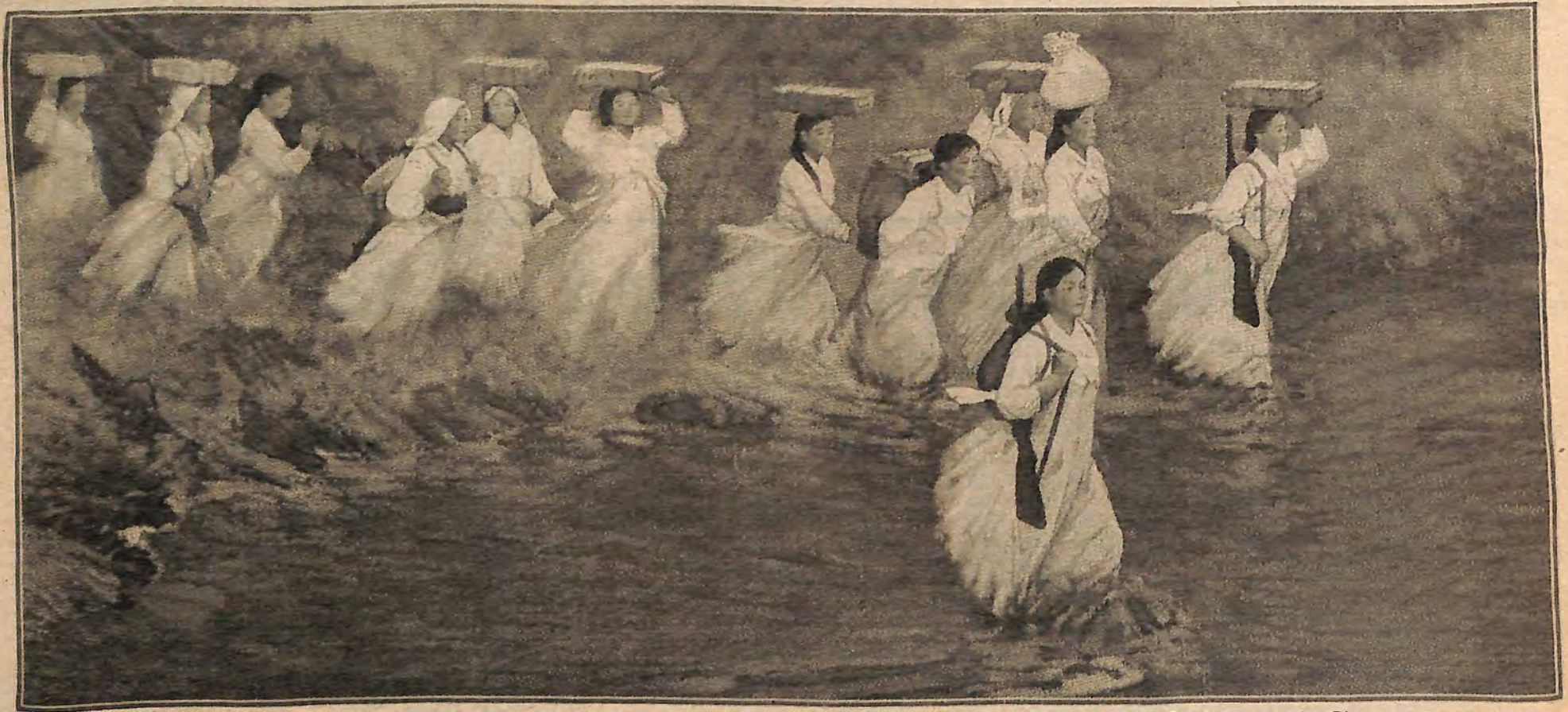
A tapestry made in a textile mill in The Peoples Republic of China around 1974-75. This was the period of the campaign to criticize Confucius and Lin Biao.

"tough" schools like Mission and Balboa High where they run with Black, Chicano, Central American, Filipino and other youth from mainly the lower strata of the proletariat. For many Indochinese families, this is the first generation that is learning to read and write and is able to meet a wide variety of people outside the narrow confines of the family and home. Much more than with their mothers, there is both the basis and the rebellious spirit for these young women to break out of the hold of reactionary tradition. Ironically, even as the imperialists went on a rampage of murder, bombings and pillage to maintain the reactionary order in their neocolonies in Southeast Asia, they have created further conditions for the oppressed to rise up, including more fuller participation of women in the struggle to turn the old order upside