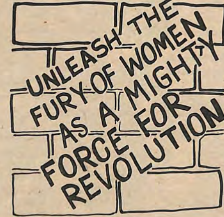
back of shirt

ORDER IN TIME TO WEAR ON INTERNATIONAL WOMEN'S DAY!