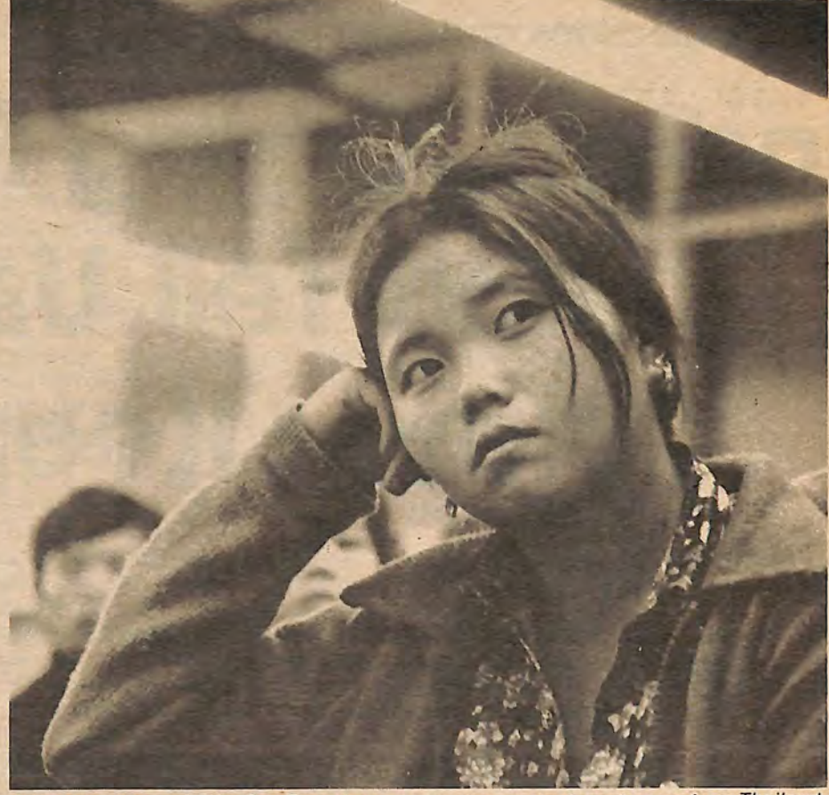
A Hmong woman in the San Francisco processing center for refugees from Thailand.

It is not uncommon to find young women of junior high and high school age whose parents, according to custom,