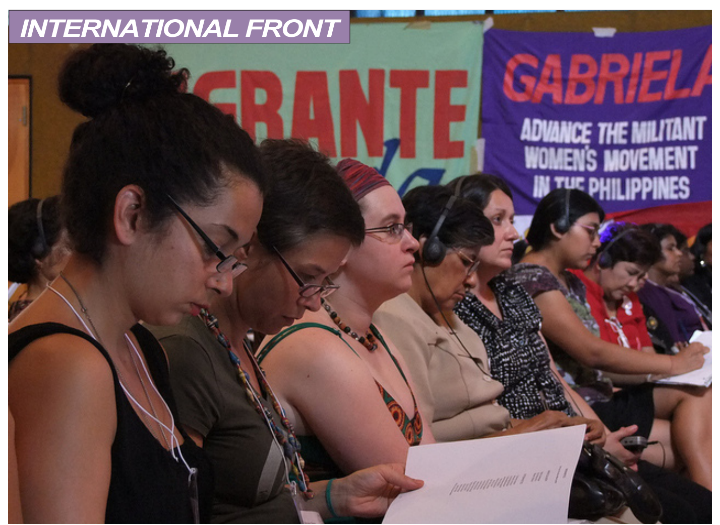
Women from more than 30 countries around the world converged in Canada on 13-16 August for the Montreal International Women's Conference. The Conference became the venue for launching the International Women's Alliance, a global anti-imperialist women's movement for the 21st century. (Story begins on page 12)