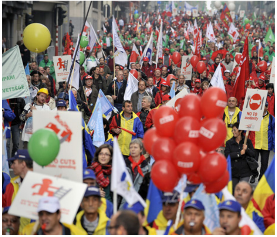
Tens of thousands of workers across Europe converged in Brussels, 29 Sept to say "NO to austerity measures".