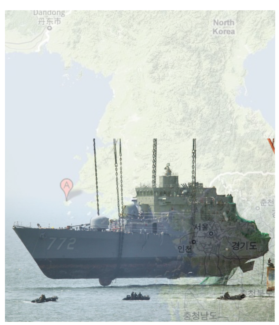
The wrecked remains of the ROK Navy corvette Cheonan, hoisted from the waters off north Korea.

"Should the south Korean authorities persist in their provocative war exercises in conspiracy with foreign forces, peace and stability will never settle on the Korean Peninsula but confrontation and distrust between the north and the south will further fester and this will lead to the outbreak of a nuclear war," it further stressed.