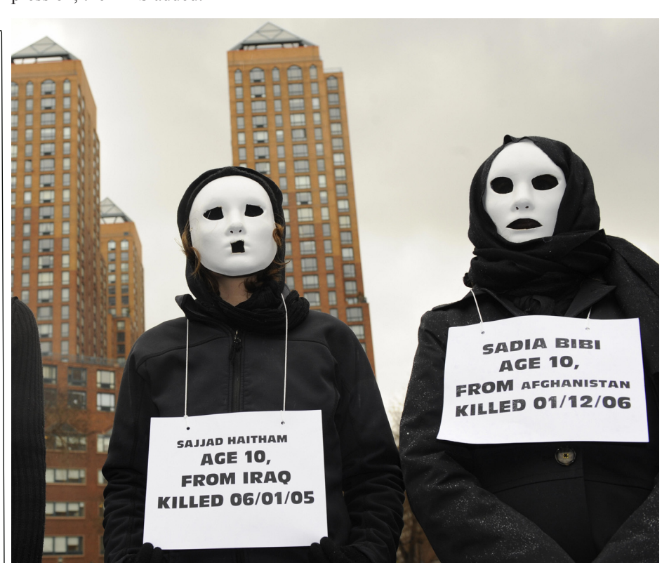
Victims of US military aggression.

The workers are not fooled by the lies and manipulation of the monopoly capitalists. The labor confederation Kilusang Mayo Uno (KMU-May 1st Movement) of the Philippines aptly stated in its solidarity message with the striking workers in Europe, "It is just for the workers and peoples of Europe and the world to fight the efforts of the monopoly-bourgeoisie and the finance oligarchy to pass on the greatest burden of the current crisis on them. We call on the workers and peoples of the world to carry our present protests to their logical conclusion, to the struggle to end imperialism and bring forth socialism through our collective and militant struggles!" ■