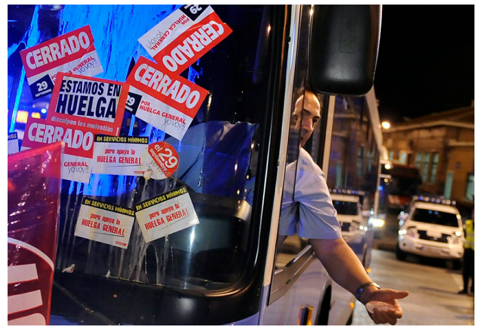
Trade unions in Spain declared a 24-hour general strike on 29 Sept to protest the cutbacks in social benefits and other so-called austerity measures of the government.