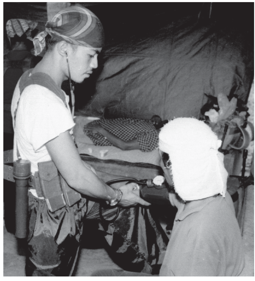
Medical officers of the NPA provide health services and training, and help in setting up community health programs under the supervision of the local Party branch and the organ of Red political power. file photo.

The nationally-coordinated campaign was kicked off with health trainings for medical officers of the NPA at the regional, guerrilla front and platoon levels. Initiated and developed by the National Health Bureau of the Communist Party of the Philippines (CPP) and the Medical Section of the NPA National Command, the trainings are providing medics with the capacity