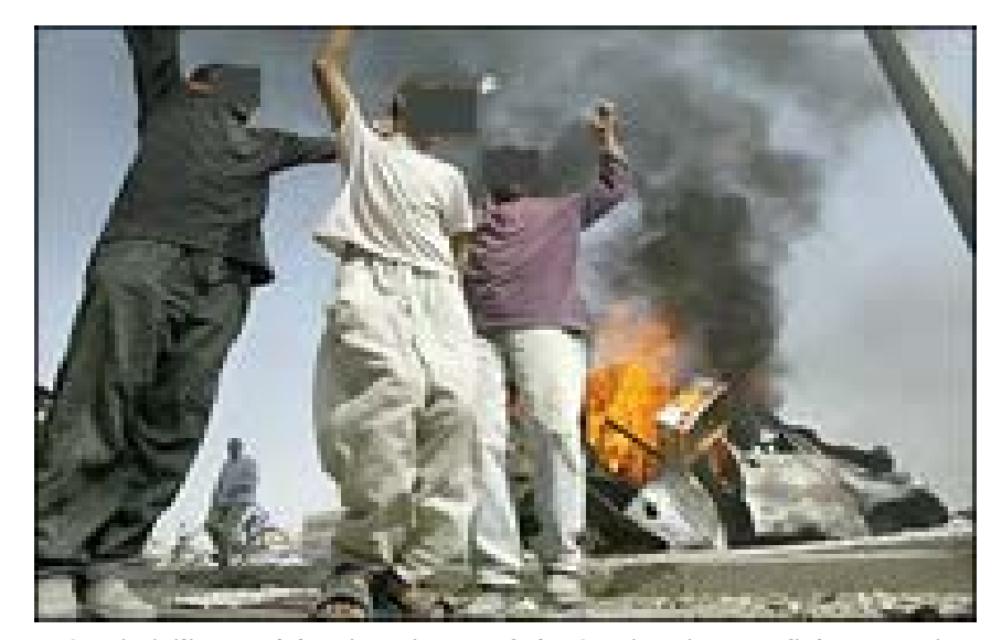
Iraqi civilians celebrating victory of the Iraqi resistance fighters against US forces

Interestingly, criticisms and calls for change coming from the Washington