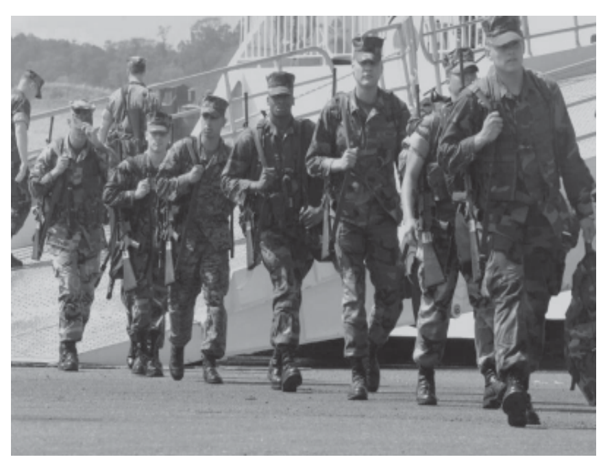
US Marines arrive at the former US naval base in Subic, Zambales, in northern Philippines, from their High Speed Vessel, for the "shoulder-toshoulder" joint military exercise.

This Anti-Terrorism Bill, just like the US Patriot Act and the US Military Commissions Act, must be vigorously opposed by the Filipino people and all freedom-loving peoples. ■