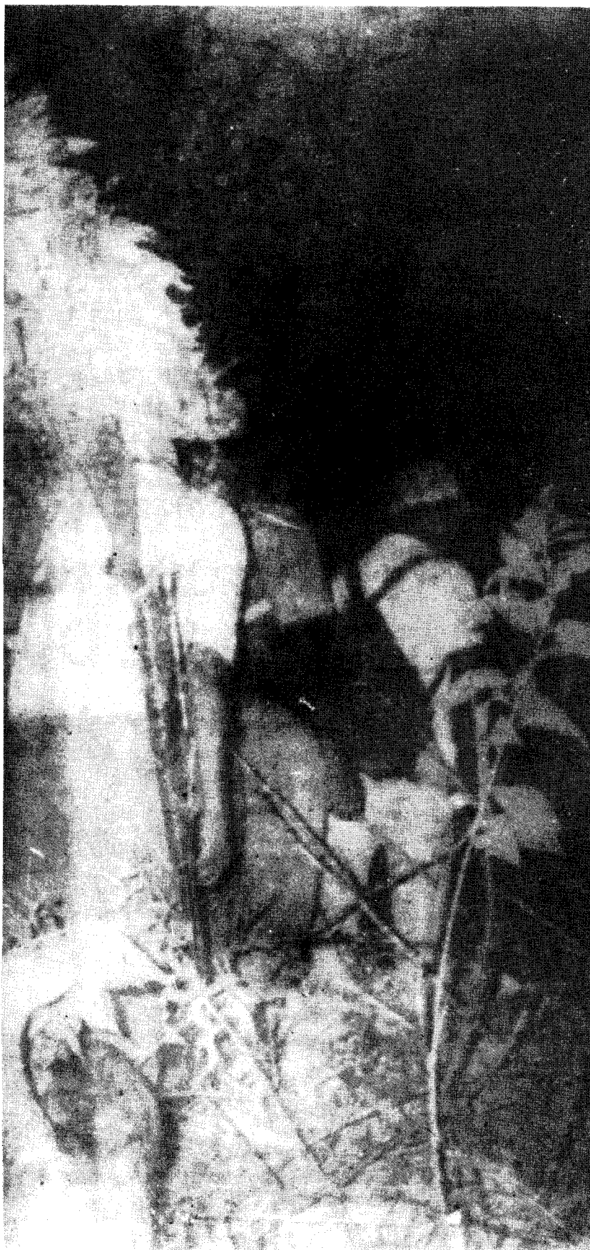
Photo of PCP guerrillas taken at night, from El Diario.