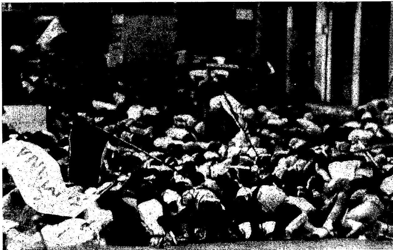
22 January 1987. Troops of the Aquino regime opened fire on a peasant protest demanding land reform. At least 18 were killed and over 100 wounded.

the elections was said to play into Marcos' hands, since the purpose of the elections was said to be his efforts to legitimise his rule. The CPP even repeatedly stated that the snap election was held at the initiative of Marcos ( Ang Bayan Dec 1985). Similarly, it was argued that legitimizing Marcos was the U.S. imperialists' point in going along with Marcos' election manoeuvre.