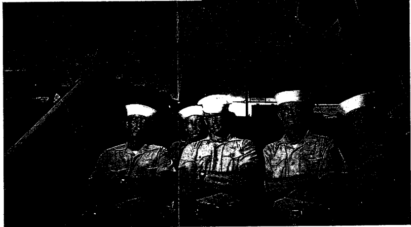
Sailors from Subic Naval Base in the Philippines, perhaps the U.S.'s single most vital foreign military base.

geoisie is that there is always a tendency to consider political activity in the cities as the principal form of political activity." ( Main Tasks of the Party ) Or as you put it even earlier: "In line with Mao Tsetung Thought, the Party must consciously shift its centre of gravity to the countryside. All previous party leaderships have suffered failures that were singularly characterised by political activity that had its centre of gravity in the city of Manila." ( Rectify Errors and Rebuild the Party , 1968)