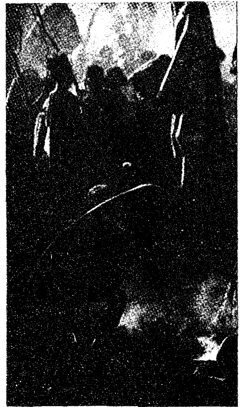
Batie Refugee Camp in the Wollo regio

There are now numerous refugee centres in Ethiopia where at dawn they come to take away the dead whose life, already sucked nearly dry by malnutrition, has finally been stolen by the early morning chill. Each morning, in each camp, there are dozens of dead. Estimates of the number of Africans killed by starvation in the months of November and December run as high as three-quarters of a million. Two hundred thousand people are said to have died in Mozambique in the last two years.