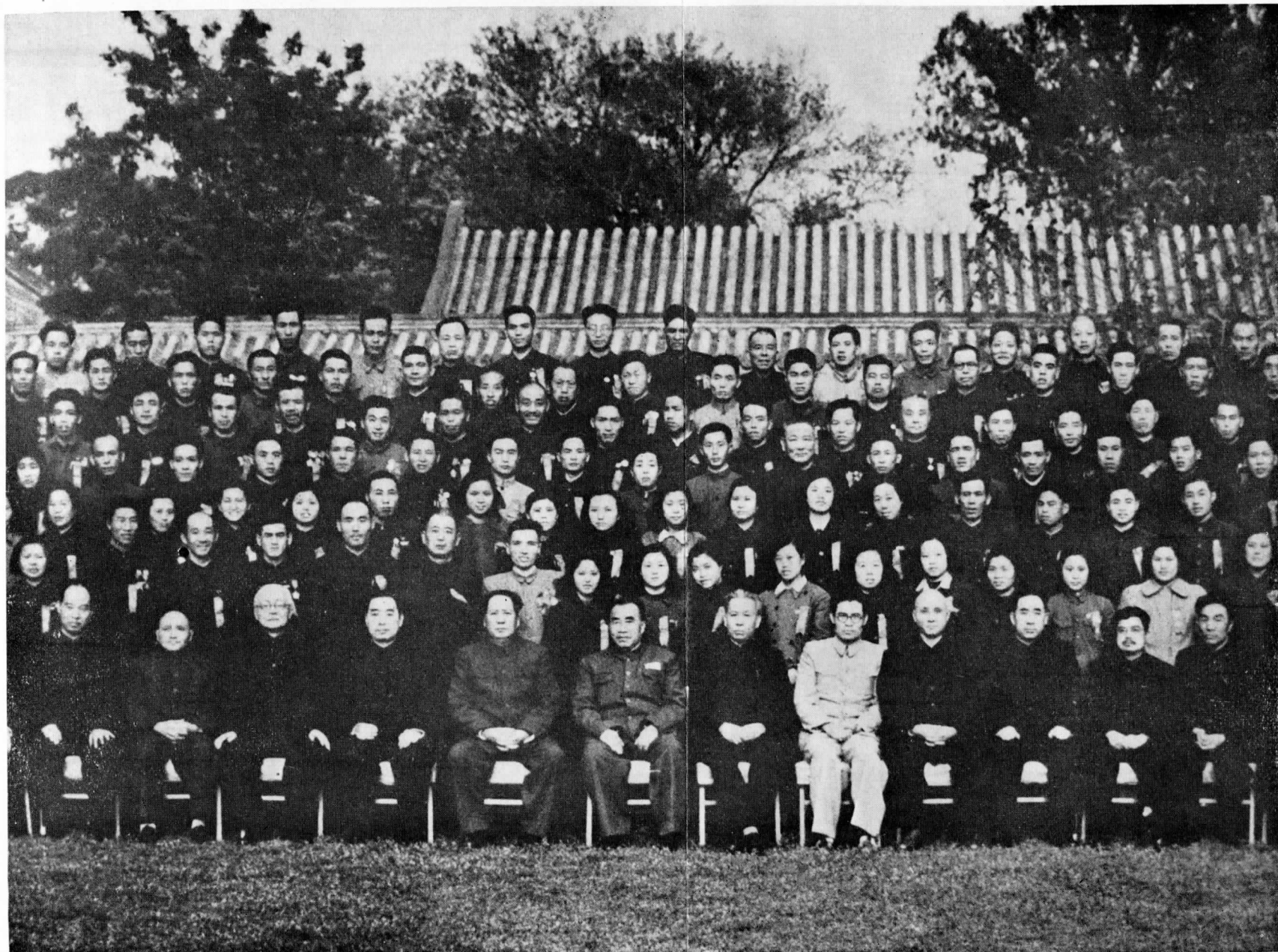
Chairman Mao Tse-tung and leading government officials with delegates to the Seventh All-China Congress of Trade Unions