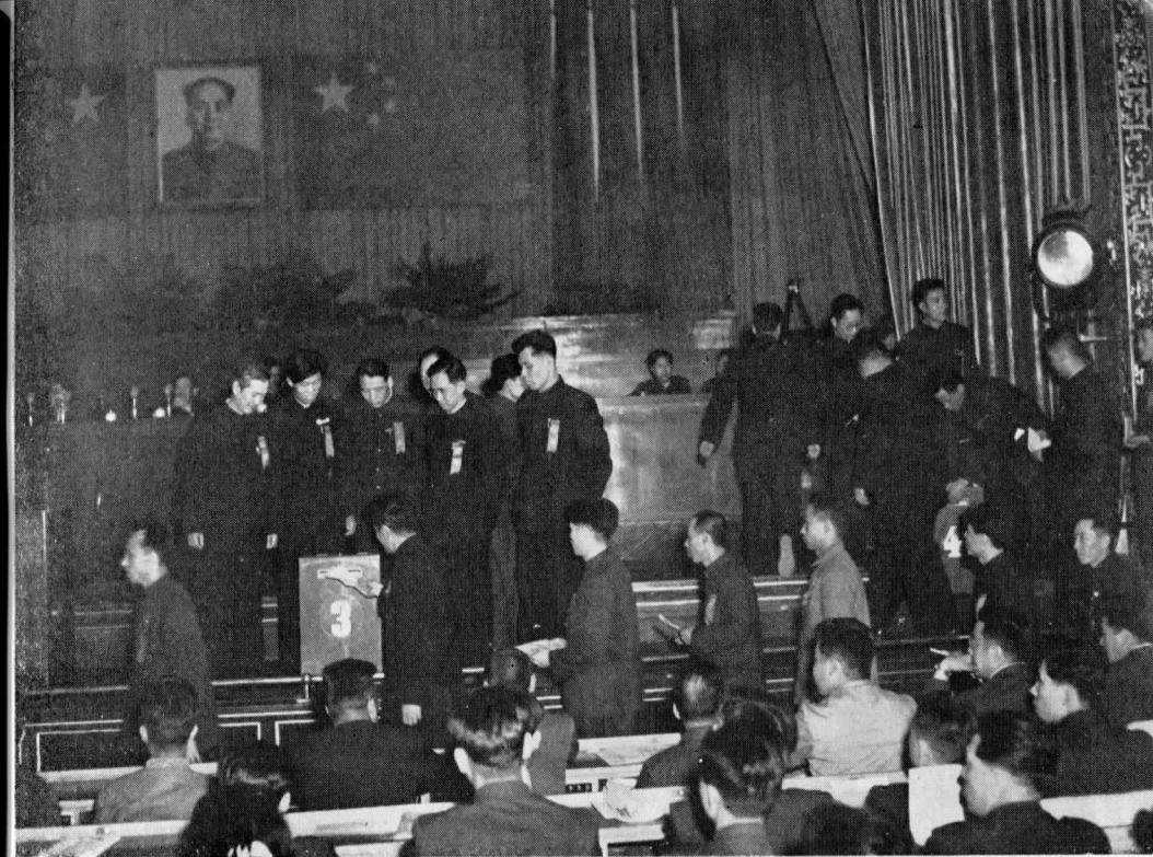
Delegates electing the leading body of the trade unions of China