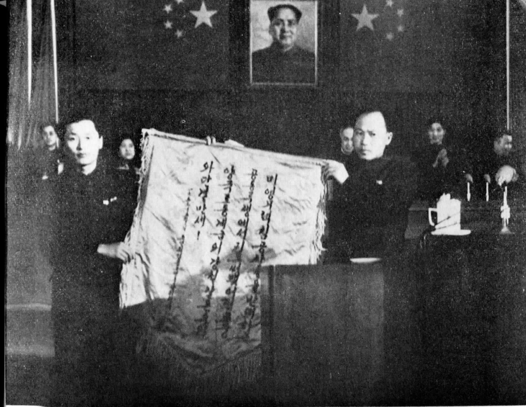
The Korean trade union delegation presenting a banner to the Congress