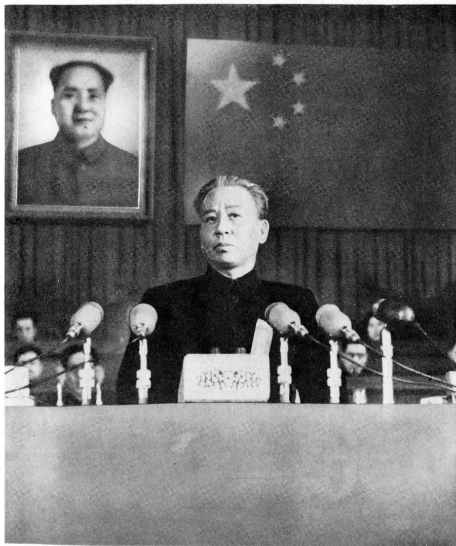
Comrade Liu Shao-chi, Secretary and representative of the Central Committee of the Communist Party of China, greeting the Congress