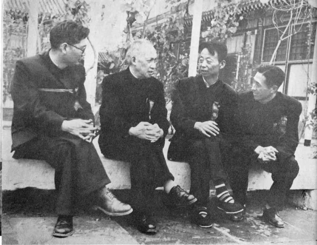
Comrade Wu Yu-chang, Chairman of the National Committee of the Educational Workers' Trade Union of China, chatting with educational workers from different places