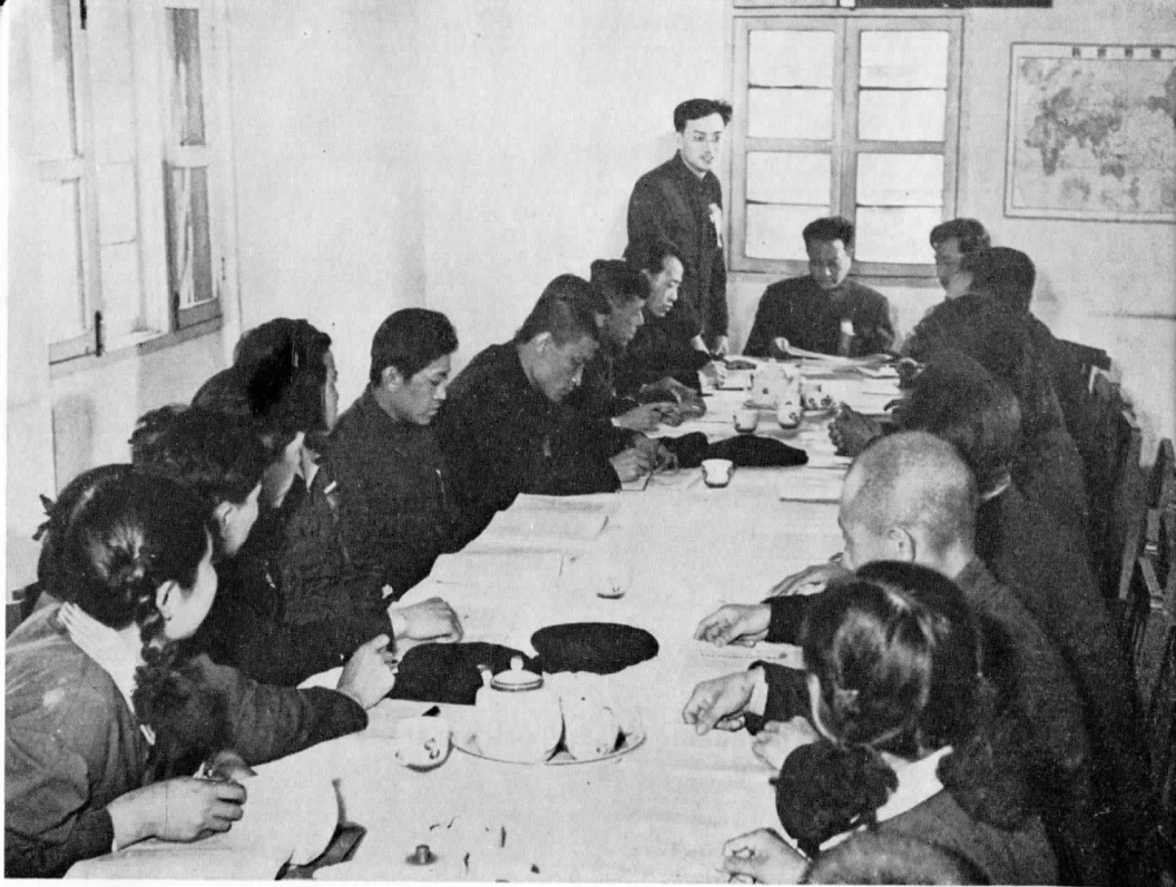
Delegates break into groups to discuss the various reports. Picture shows the Northeast group