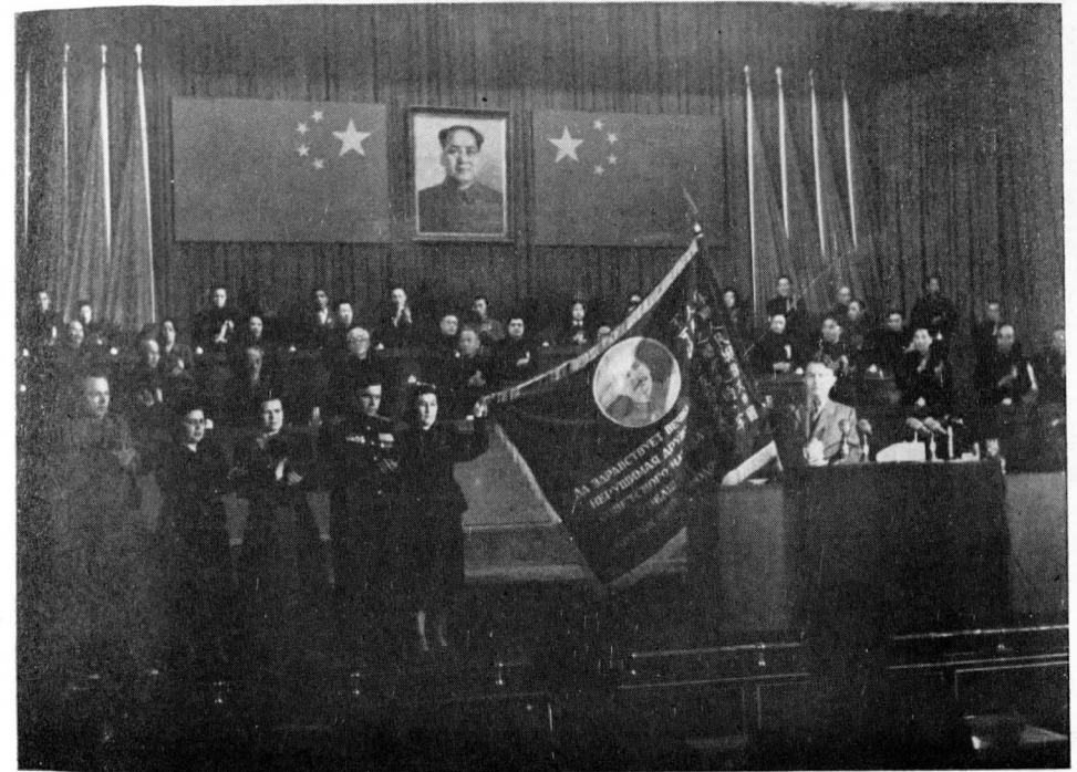
The Soviet trade union delegation presenting a banner to the Congress