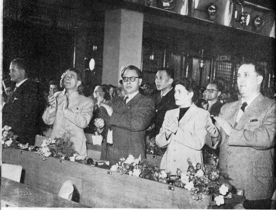
Delegation of the World Federation of Trade Unions