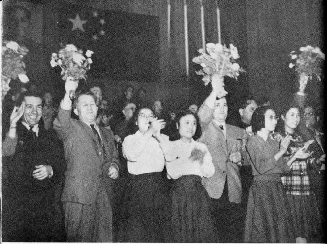
Representatives of Peking workers presenting bouquets to foreign delegates attending the Congress