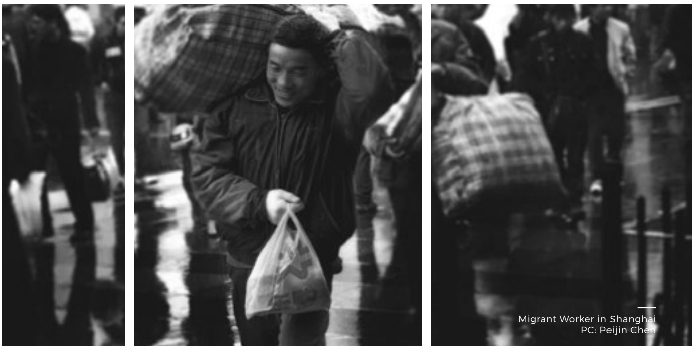
Migrant Worker in Shanghai

China's economic slowdown is likely to result in yet fewer employers willing to enrol migrant workers into the social insurance schemes mandated by law. In response to this, earlier this year the central government reduced employer contribution rates for pension and unemployment insurance, and for the housing provident fund. Nevertheless, the central government is likely to continue to put pressure on sub-national governments to enrol rural migrant workers into the social insurance system, because it now