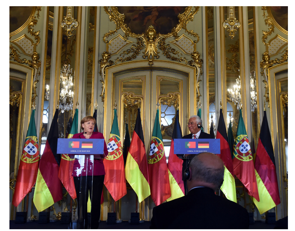
German Chancellor Angela Merkel (left) says that the U.S. decision to impose import tariffs on EU countries is not in line with WTO rules at a press conference with Portuguese Prime Minister Antonio Costa in Lisbon on May 31

However, the political system in the United States has made the most of the dividends of U.S.-led globalization, pocketed exclusively by