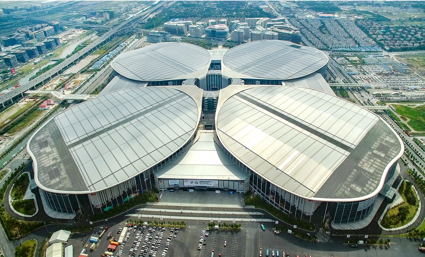
China International Import Expo, first expo in the world featuring the theme of import, will open in International Exhibition and Convention Center (Shanghai) in November 5-10, 2018

quicker pace. In practice, among the world's 200 plus developing economies after WWII, 13 had managed to utilize the "latecomer's