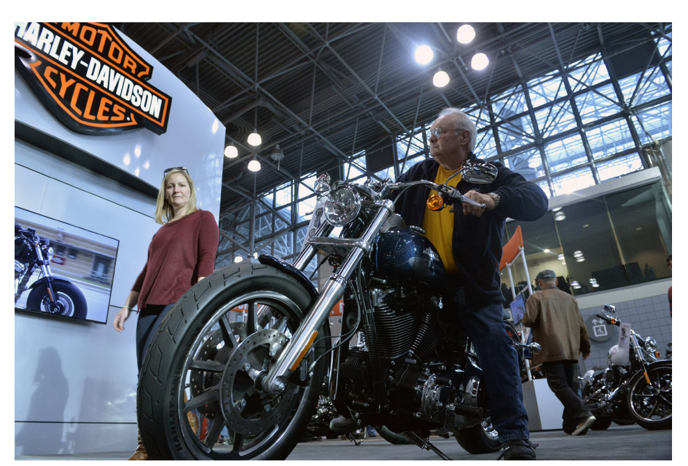
Motorcyclists at an international motorbike exhibition in New York on December 11, 2015. In late July, U.S. motorcycle producer Harley-Davidson announced that it would move some of its production overseas to avoid retaliation from the European Union in response to U.S. tariffs on steel and aluminum imports

The author is an associate researcher with Chongyang Institute for Financial Studies at Renmin University of China