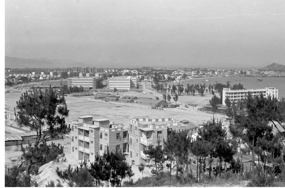
Shekou Industrial Zone, Shenzhen, in 1980s

One of the most important achievements of reform and opening up is the development theory that China has summarized from its practice, which has not only enabled China to understand the past and present, and prepare for a better future, but can continue to help other developing countries to turn their vision for development into reality.