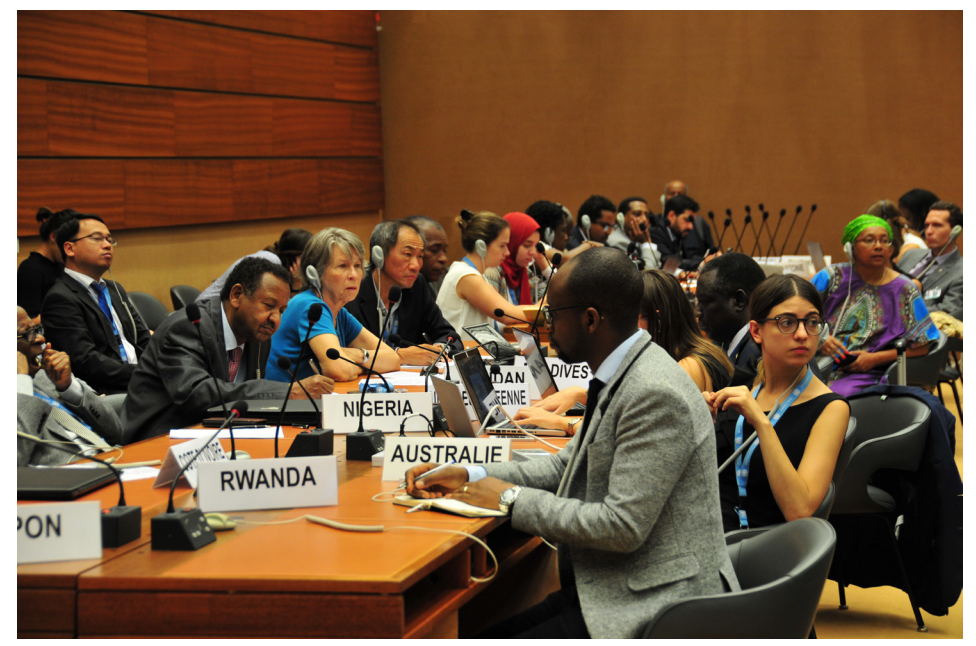
Officials from China and African countries share development and poverty reduction experiences at a seminar during the 38th UN Human Rights Council meeting on July 3 in Geneva, Switzerland

nternational scholars praised Chinese President Xi Jinping's speech at a two-day conference on China's foreign affairs, which elaborated on various topics, including China's vision to build a community with a shared future for mankind.