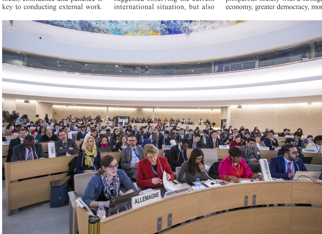
On March 23, 2017, the UN Human Rights Council adopts two resolutions on the realization in all countries of economic, social and cultural rights and the right to food, which clearly called for efforts to build a community with a shared future for mankind, at its 37th session in Geneva, Switzerland

Calling the period between the 19th and 20th CPC national congresses "a historical juncture for realizing the Two Centenary Goals of China," Xi said the period is of great significance in the historical progress of the great rejuvenation of the Chinese nation. According to the twin goals, China will become a moderately prosperous society with a stronger economy, greater democracy, more