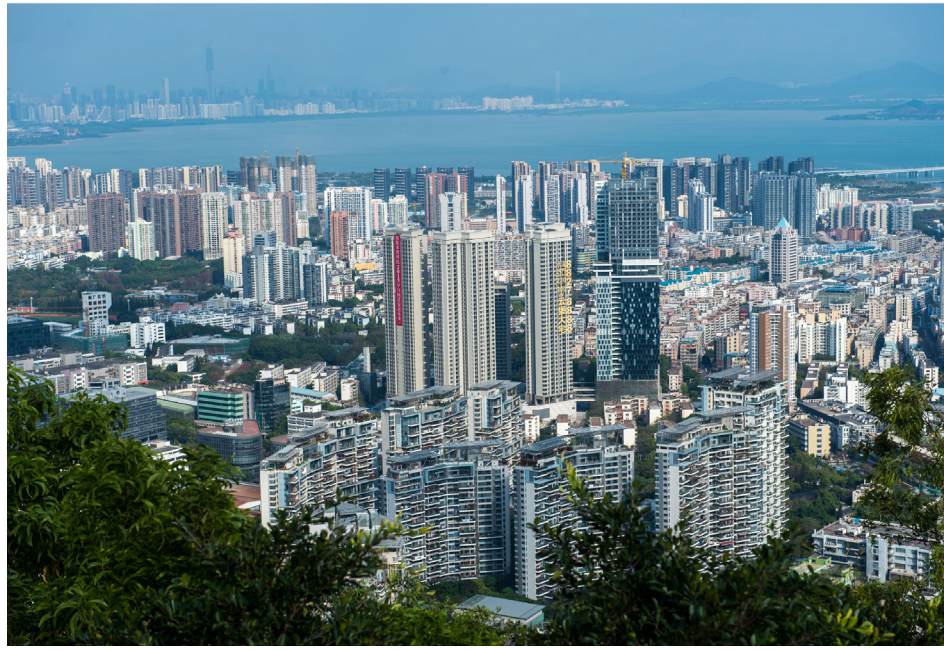
Shekou Area of Shenzhen, Guangdong Pilot Free Trade Zone, on February 26, 2015 economists worldwide. I became the ninth chief

economist of the World Bank, and those who came before me were leaders in their field who not only contributed to economics, but many of whom also had rich political experience. Yet one of the most important factors which qualified me for the job was China's economic development and its huge contribution to worldwide poverty alleviation.