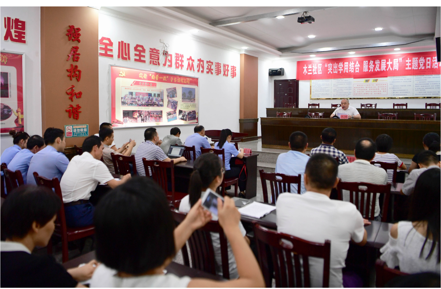
A Party branch of a community in Putian City of east China's Fujian Province helds a general meeting on October 12, 2017

Based on a report published on People.com.cn authorized by Office Administration , a monthly publication of the General Office of the CPC Central Committee.