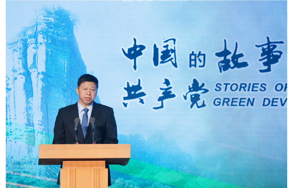
Song Tao, Minister of the International Department of the CPC Central Committee gives a speech at the thematic briefing

Around 400 political figures and delegates from Europe, Pakistan, Bangladesh, Myanmar and other countries gathered to exchange their experience in promoting green development.