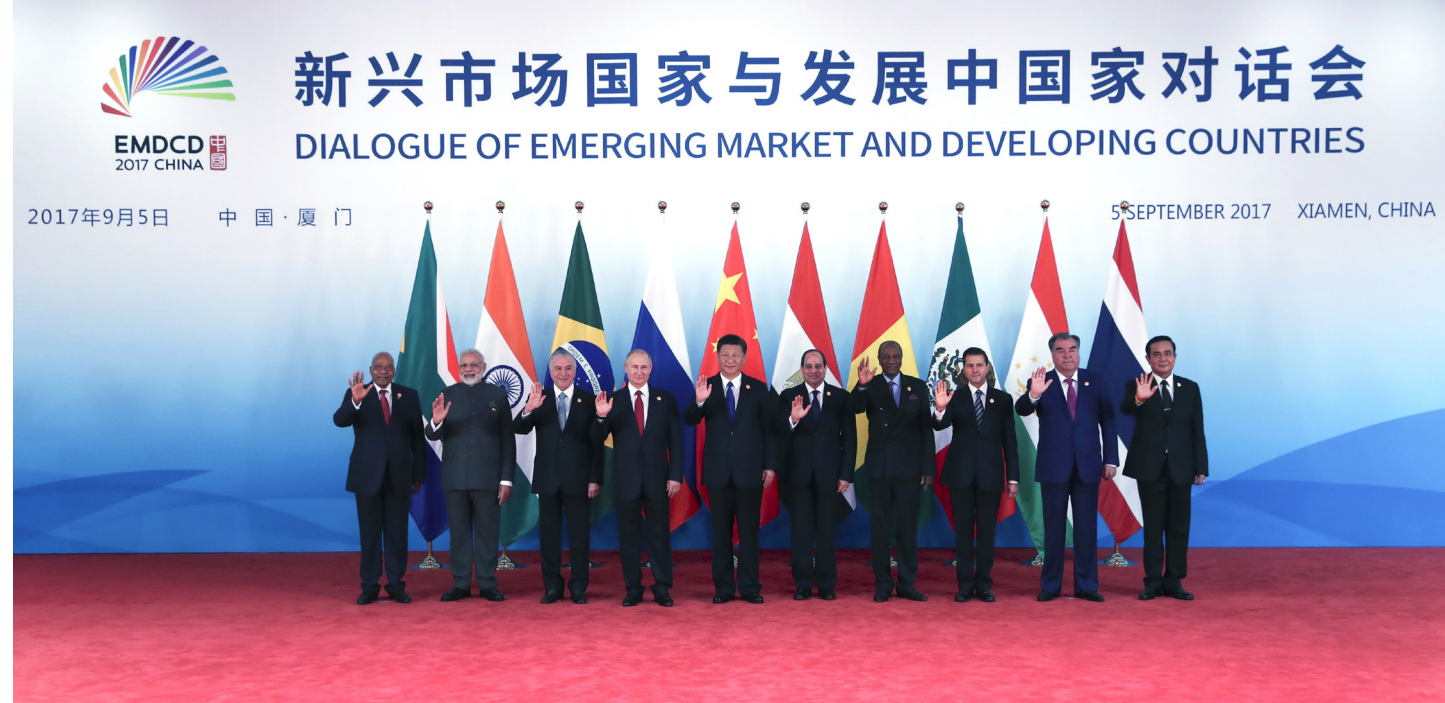
Leaders from the five BRICS countries, as well as Egypt, Guinea, Mexico, Tajikistan and Thailand, pose for a group photo on September 5 in Xiamen, southeast China's Fujian Province (XINHUA)

hen the first BRIC Summit was held in 2009 in Moscow, the Chinese version of the bloc leaders' joint statement was only around 1,500 characters. This month, the Xiamen Declaration of the Ninth BRICS Summit saw its list of outcomes exceed 12,000