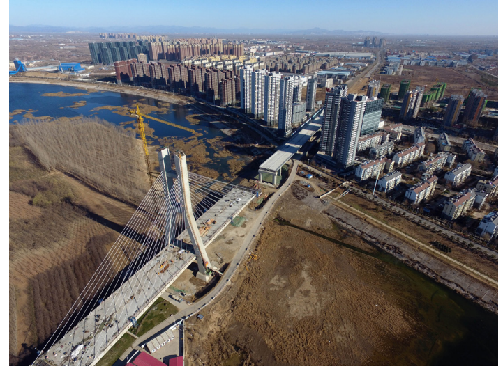
Chaobaihe Bridge, which will connect Beijing's Tongzhou District and Hebei's Yanjiao County, under construction on November 27, 2016