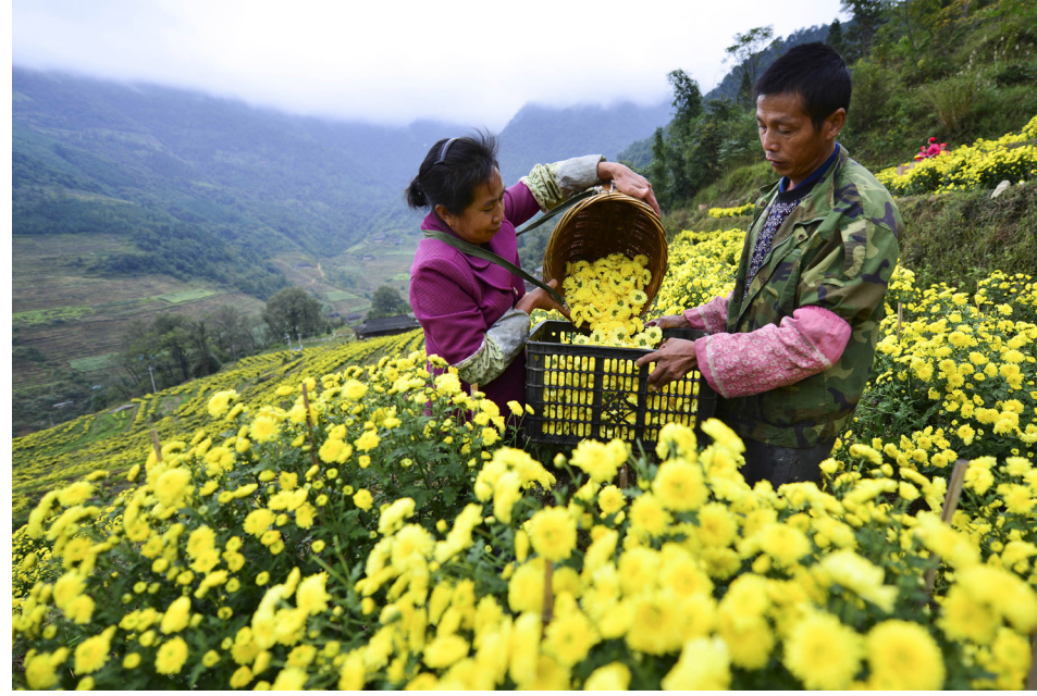
Farmers harvest chrysanthemum flowers in Zhoujia Village of Longsheng Multinational Autonomous County, south China's Guangxi Zhuang Autonomous Region, November 2, 2016 (XINHUA)

The "No. 1 central document" is the name traditionally given to the first policy statement of the year released by the central authorities and is seen as an indicator of policy priorities.