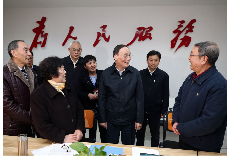
Wang Qishan (center), Secretary of the CPC Central Commission for Discipline Inspection, the Party's top discipline watchdog, visits a community in Zhenjiang, east China's Jiangsu Province, on December 5, 2016

The anti-corruption battle must go deeper, President Xi Jinping said on January 6, calling for strict governance of the Communist Party of China (CPC) systematically, creatively and effectively.