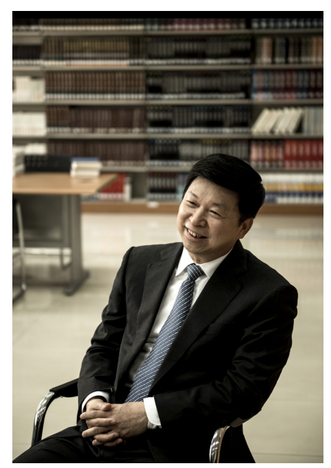
Song Tao, Minister of International Department, CPC Central Committee (DONG JIEXU, CHINA NEWSWEEK)

Adhering to openness and inclusiveness in building a better world of win-win cooperation. As the Chinese have advocated since the ancient times, "all living things are nourished without injuring one another, and all roads run parallel without interfering with one another." The history of world economic development attests to the fact that open-up leads to progress whereas lock-up leads to regress. It is based on this understanding that General Secretary Xi Jinping emphasizes the importance of helping "build a new type of international relations and a better world of win-win cooperation". Upholding this concept, General Secretary Xi Jinping put forward for the first time his vision of global economic governance featuring equality, openness, cooperation and sharing at the G20 Hangzhou Summit and stressed the need to oppose all forms of protectionism and lead the process of economic globalization towards inclusiveness and universal benefit at the APEC Economic Leaders' Meeting in Lima, which witnessed that the concept of projects "being jointly built through consultation to meet the interests of all" was written into the leaders' declaration for the first time. The Belt and Road Initiative has become the largest platform for countries to achieve common development and win-win