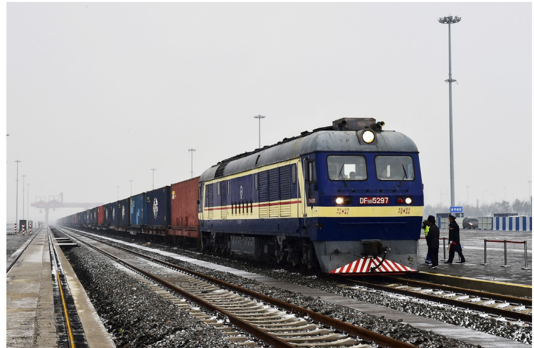
A cargo train from the China (Tianjin) Pilot Free Trade Zone in the northern port city of Tianjin ready to depart to Minsk, Belarus, on November 21, 2016