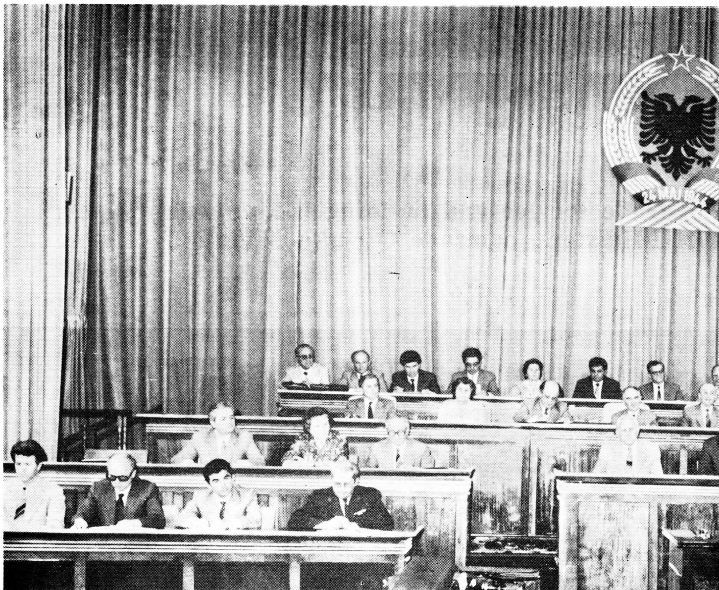
The Presidium of the mee

teachings and instructions of Comrade Enver Hoxha, will guard Albania and the victories achieved like the apple of our eye, that we will make the economy and the defence of the Homeland, the unbreakable steel unity of the Party with the people even stronger, that we will enhance and sharpen our revolutionary vigilance, and will work with high discipline and consciousness, with a new revolutionary method and style at work, to accomplish and overfulfil all the tasks.