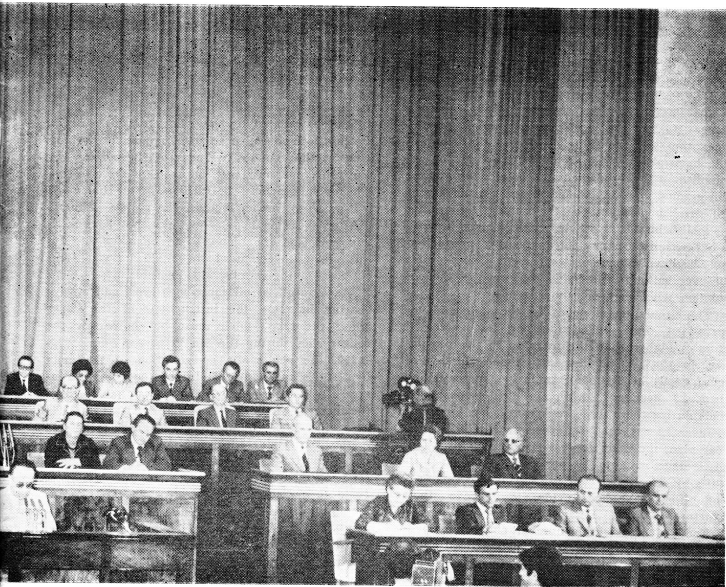
of the People's Assembly

ownership and in the direction of improving the socialist relations of production.