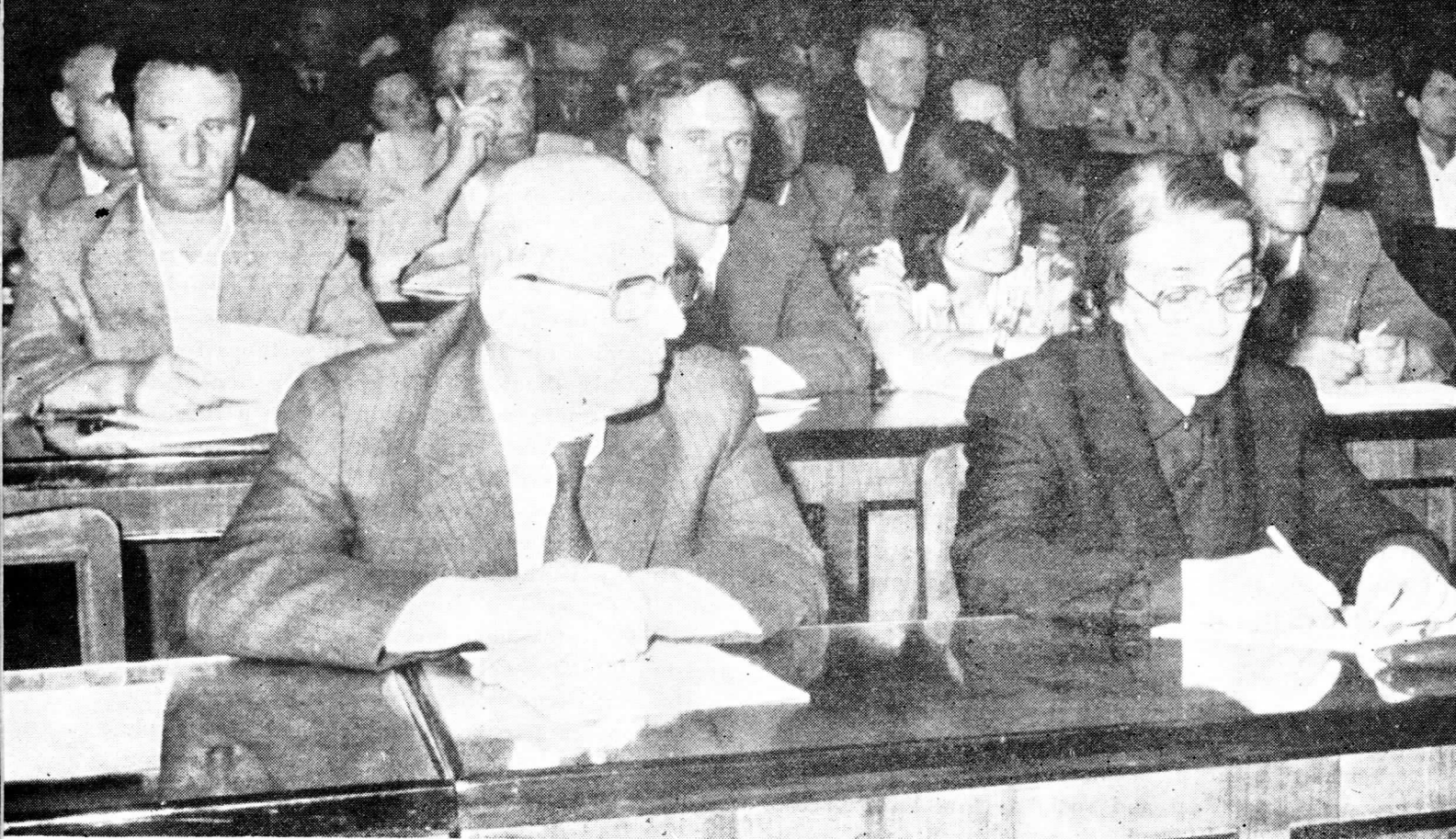
View of the hall

point out the superiority of our socialist order.