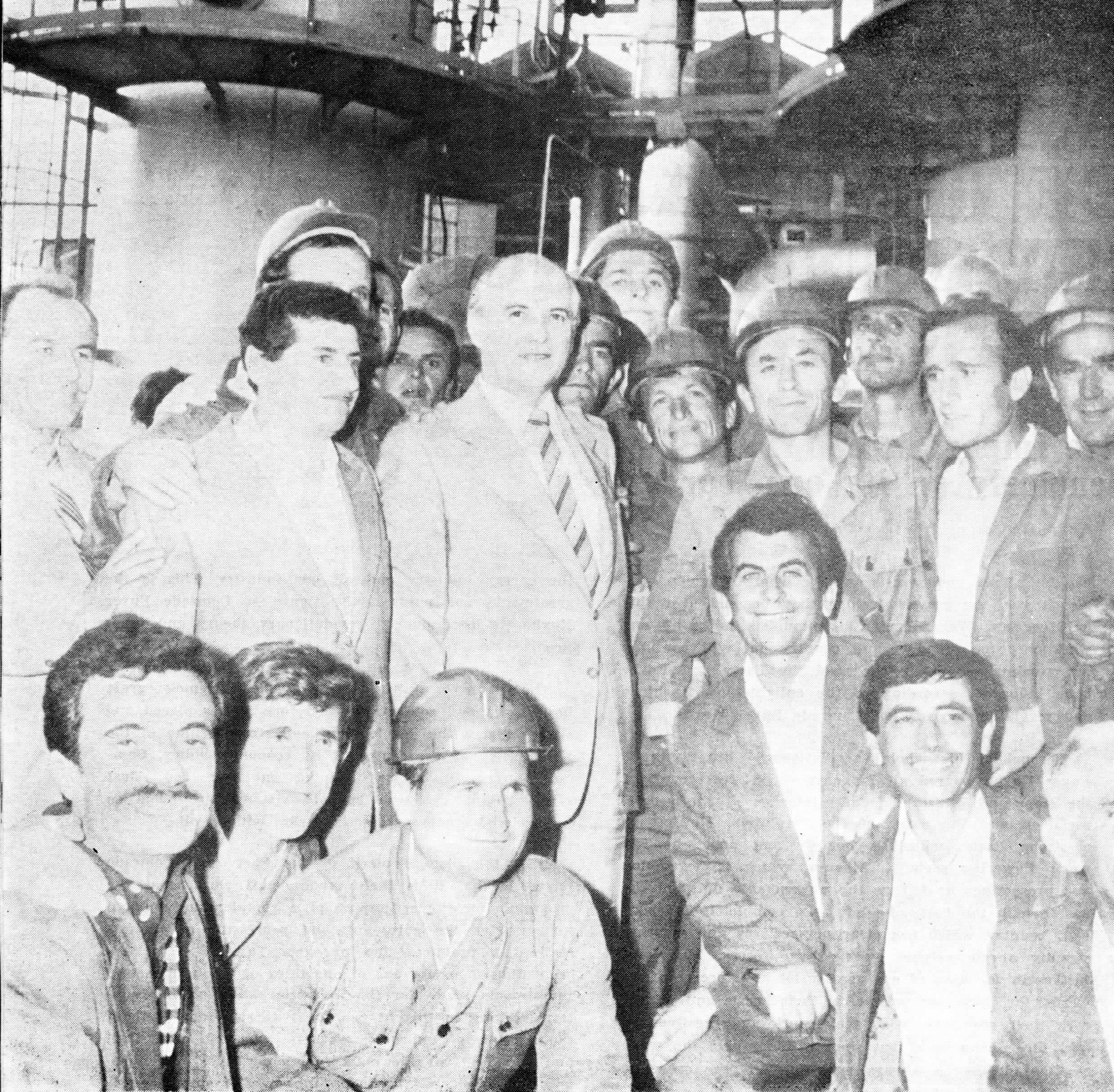
Comrade RAMIZ ALIA among the oil-workers

clash, especially, with the cunning and ferocity of external and internal enemies who strove to impede and sabotage this industry, to close its prospects of development, and to leave us like fish without water. In the past, at present and in the future, the enemies of socialism have always striven and will strive